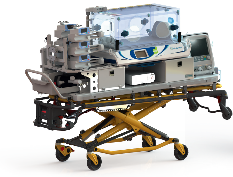
Médicruiser: road transport